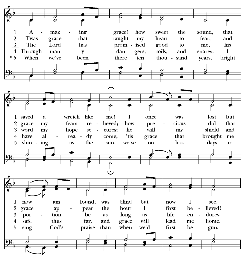
The melody may be sung in canon at distances of either two or three beats.